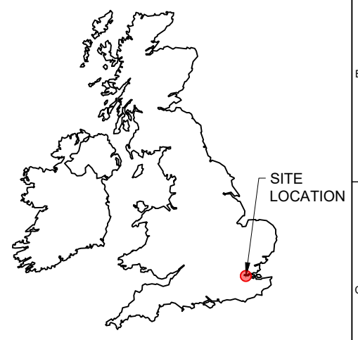
KEY PLAN - NOT TO SCALE