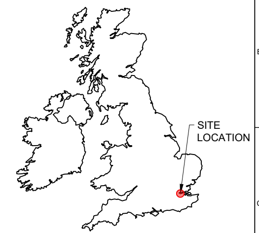
KEY PLAN - NOT TO SCALE