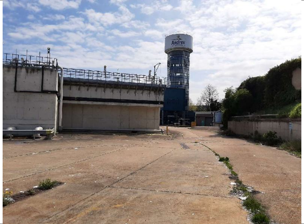
4. Effluent Treatment Plant and Water Tower.