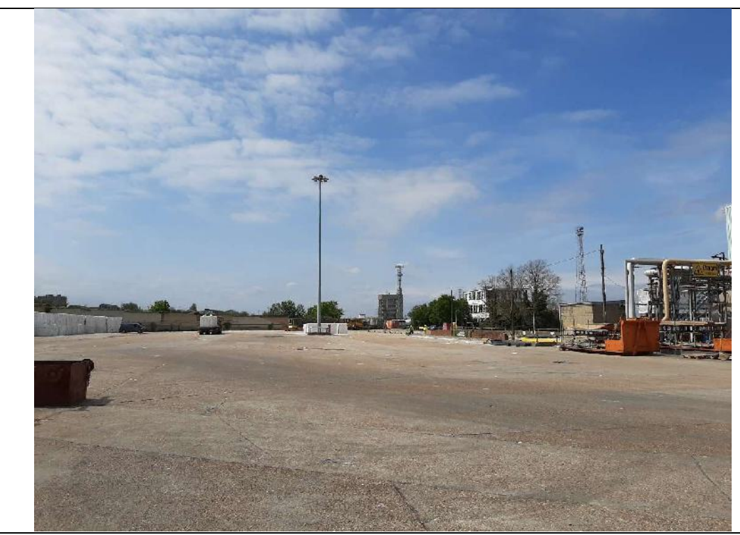
9. Proposed Development Area Looking W, south of the Boiler House.