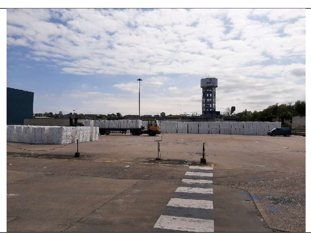
10. Proposed Development Area Looking S towards Effluent Treatment Plant.