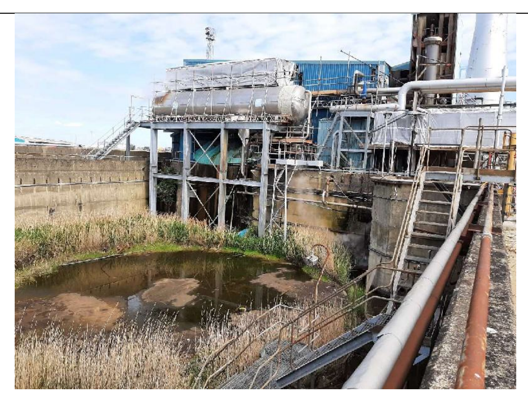
3. Boiler House Looking E showing one of the former sunken storage tank bases (former gas oil for the boiler house). The boiler house is now fired by natural gas.