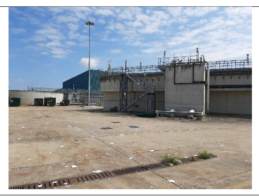
5. Effluent Treatment Plant Looking E.