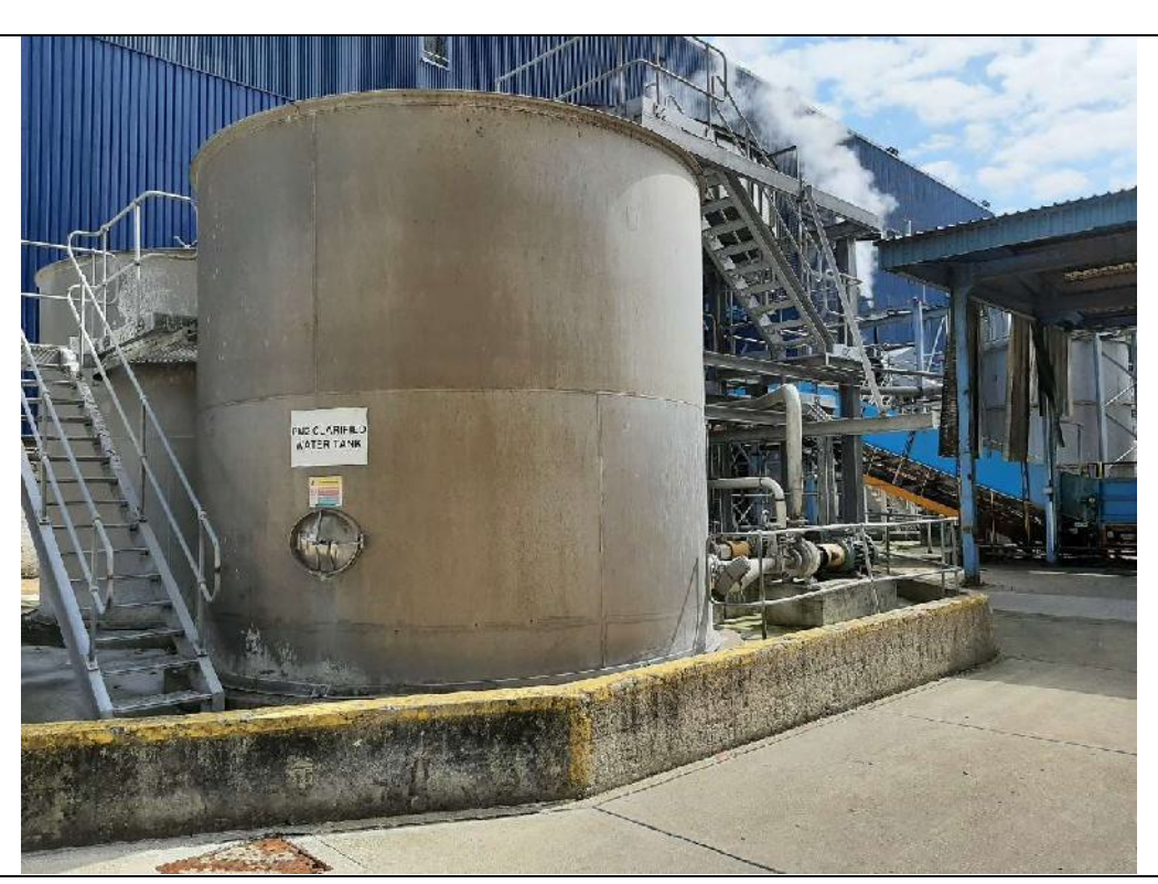
8. Water storage tank in southern area looking E.