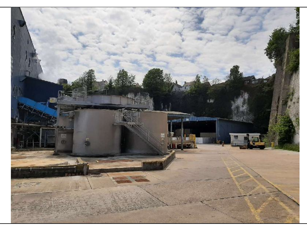
7. Storage tanks in southern area looking SE.